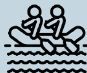
Sport & aquatic centers