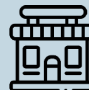
Shopping & leisure centers

This certification is suitable for any establishment worldwide interested in carrying an official inspection according to European regulations. In this sense, ENAC is recognized by the international organisations for accreditation bodies EA (European Accreditation) and ILAC (International Laboratory Accreditation Cooperation).