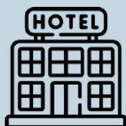
Hotels & resorts

Safe Fun certification is suitable for any establishment with water leisure attractions for public use: