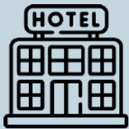
Hotels & resorts

Safe Fun certification is suitable for any establishment with water leisure attractions for public use: