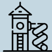
Water & theme parks