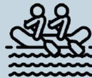
Sport & aquatic centers