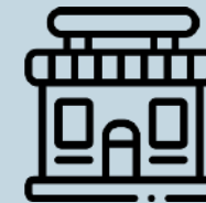
Shopping & leisure centers

This certification is suitable for any establishment worldwide interested in carrying an official inspection according to European regulations. In this sense, ENAC is recognized by the international organisations for accreditation bodies EA (European Accreditation) and ILAC (International Laboratory Accreditation Cooperation).